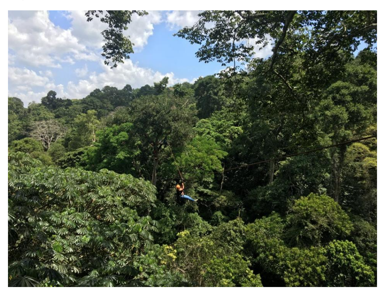
Day 12: Departure

Breakfast at leisure, relax at your hotel. You will have lunch after which we will prepare to leave Jinja and head back to Kampala. On your way to Kampala you will make a stop at Griffin Falls for Zip lining, lunch and transfer to Ssezibwa falls for a brief tour before heading out to Kampala, check into your overnight stay.