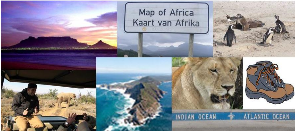
TABLE MOUNTAIN/ WATERFRONT

Today you enjoy one of the Seven Natural Wonders of the World as you summit Table Mountain by Cable Car, enjoy the sights and views from this iconic landmark. Afternoon you spend at the Waterfront, with option of going to Robben Island – where Nelson Mandela was once captive.